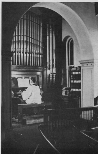
"Seated One Day at the Organ"