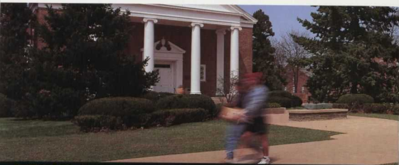
A HILLTOP CAMPUS CENTRALLY LOCATED BETWEEN THE CHESAPEAKE

THE IDEAL OF THE LIBERAL ARTS EMBODIES WHAT IS GOOD, BEAUTIFUL AND REASONABLE. THE LIBERAL PERSPECTIVE PLACES LESS EMPHASIS ON KNOWLEDGE THAN WISDOM, LESS ON SELF-INTEREST THAN THE