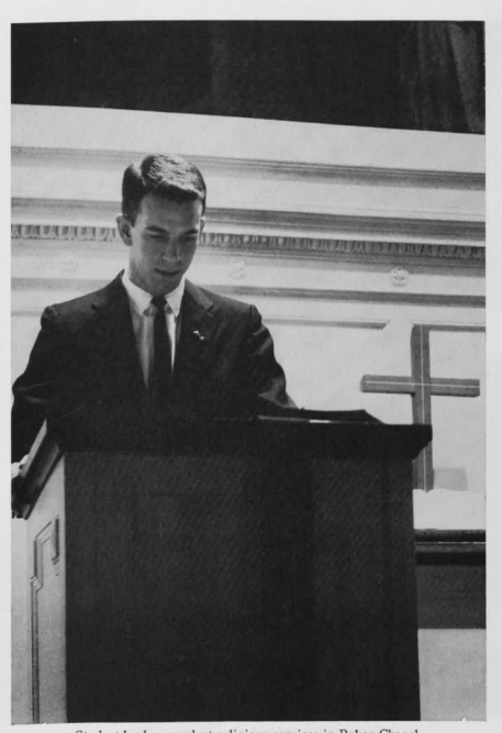
Student leaders conduct religious services in Baker Chapel.