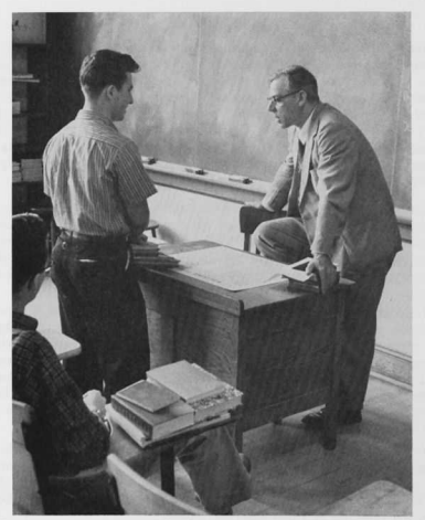
Faculty members are known for their willingness to counsel with students.

mation related to the dates when these tests will be administered, the student should consult the high school counselor or write to the College Entrance Examination Board, Box 592, Princeton, New Jersey.