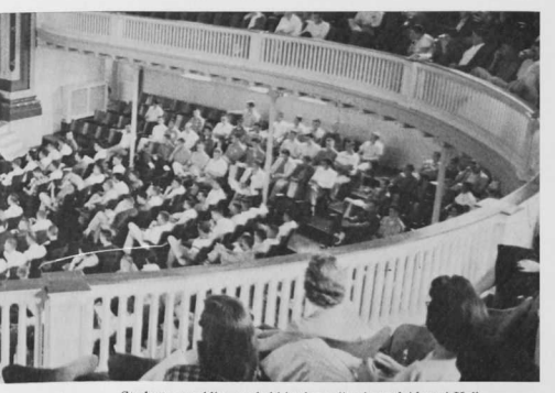
Student assemblies are held in the auditorium of Alumni Hall,

Selected students interested in a fifth year of combined internship teaching and graduate study, and selected teachers in service interested in meeting requirements for renewal of certificates or for additional certificates through part-time and summer session courses may enter the Master of Education program. During fall and spring semesters, classes in this program are offered both on the campus and in various centers in Maryland. Information concerning this program may be obtained through correspondence with the Chairman of the department of education.