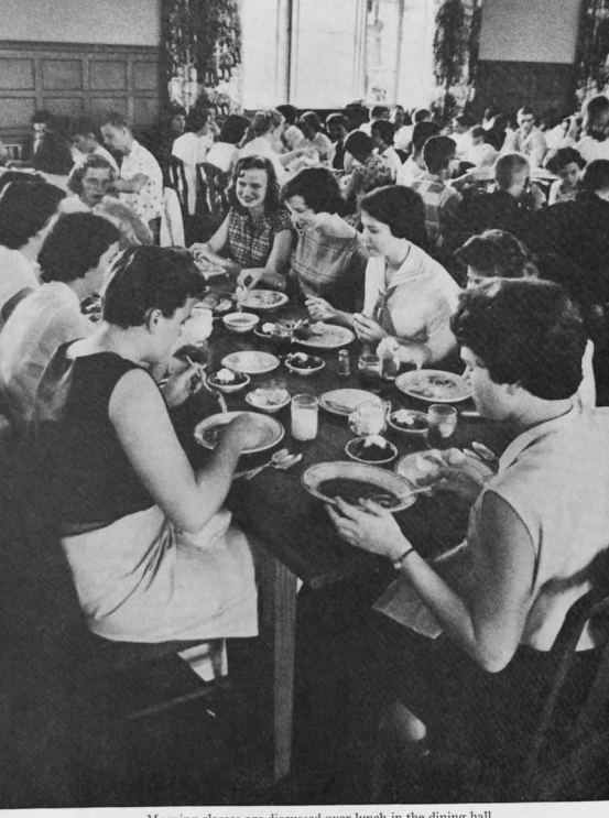
Morning classes are discussed over lunch in the dining hall.