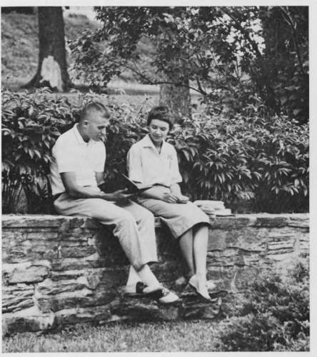
Robinson Garden, on a spring day, is a good spot for coed study.

Departments in which a major leads to the degree of Bachelor of Science are: art (less than twelve semester hours in history of art), physical education, and public school music.