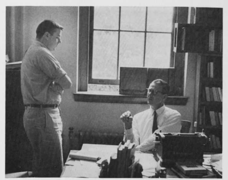
Comradeship is an essential phase of the relationship between faculty and students.