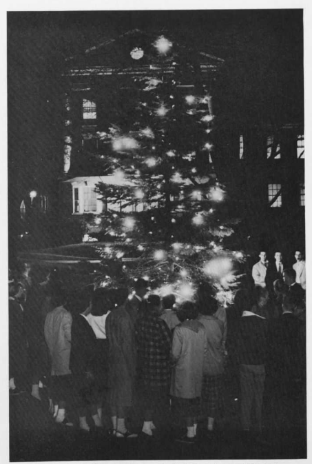
The community Christmas tree on the President's lawn is lighted at a special ceremony including group caroling.