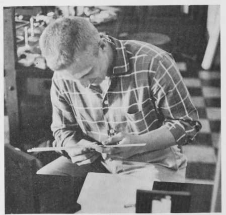
In physics lab, a slide rule is an essential partner.