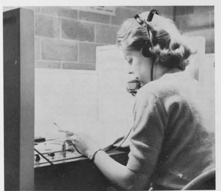
Language students gain conversational ability in the language laboratory.

307. HEAT AND PROPERTIES OF MATTER. (4) Heat and thermodynamics, elasticity, capillarity, diffusion, and viscosity. Prerequisites, Physics 201, 202 and Mathematics 201 and 202. Laboratory fee, $7.50. Three class periods and one three-hour laboratory period a week.