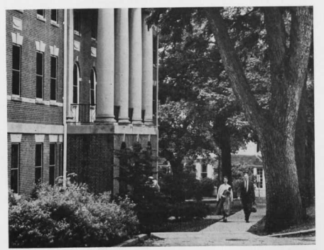
The walk past McDaniel Hall Dormitory is in fairly continuous use.